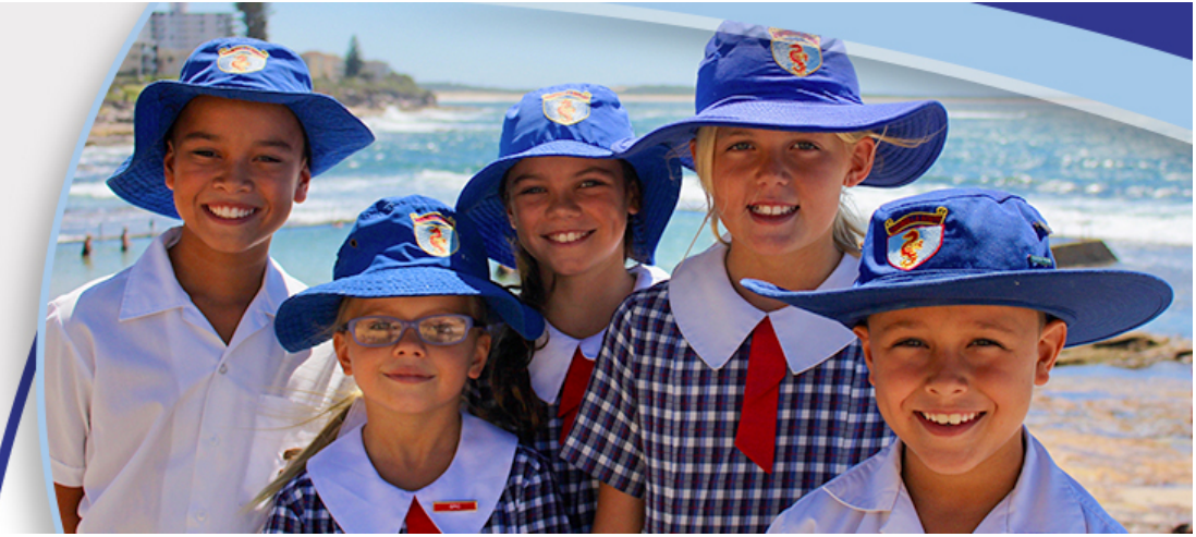
121 Ewos Parade Cronulla NSW 2230 Subscribe: https://cronullasps.schoolzineplus.com/subscribe

Email: cronullas-p.school@det.nsw.edu.au Phone: 02 9523 5649 Fax: 02 9544 1373